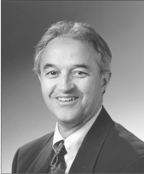
ATTORNEY GENERAL WILLIAM H. SORRELL